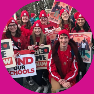
MSEA AE members at Frostburg Hagerstown joined thousands of educators from across the state to rally to fund our schools.