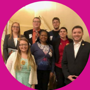
Students from the Community College of Baltimore County—Essex attended MSEA's AE Lobby Night to advocate to Fix the Fund to assure casino revenues enrich the education budget as in the education budget.