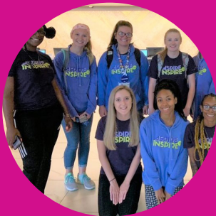
Ten Aspiring Educators, representing five Maryland campuses, attended the 2019 NEA Aspiring Educator Leadership Summit in Houston.