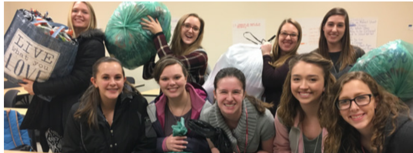
Members of FSEA at Frostburg State—Hagerstown with hundreds of blankets they made for babies in the local hospital.