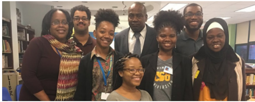
Coppin State MSEA chapter at their local elementary school during Read Across America Week. They read to students and donated books to the classroom.