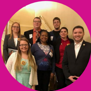
Students from the Community College of Baltimore County—Essex attended MSEA's AE Lobby Night to advocate to Fix the Fund to assure casino revenues enrich the education budget as in the education budget.