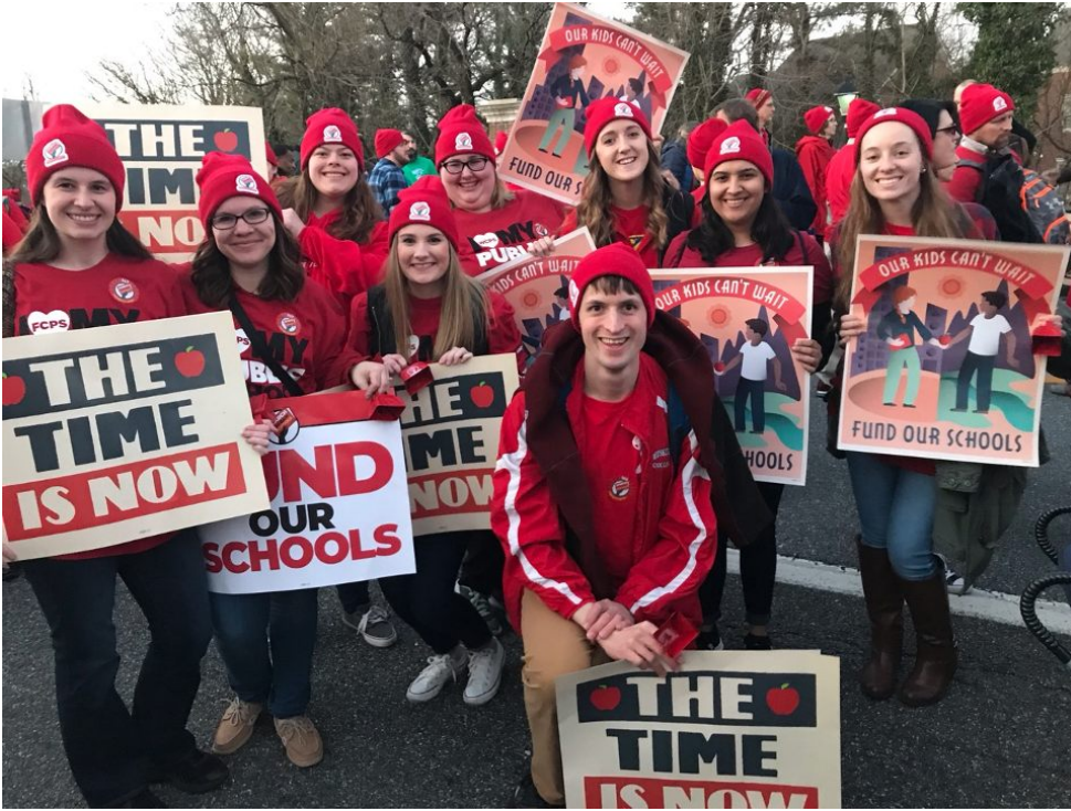
MSEA AE Members at Frostburg Hagerstown joined thousands of educators from across the state to rally to fund our schools!