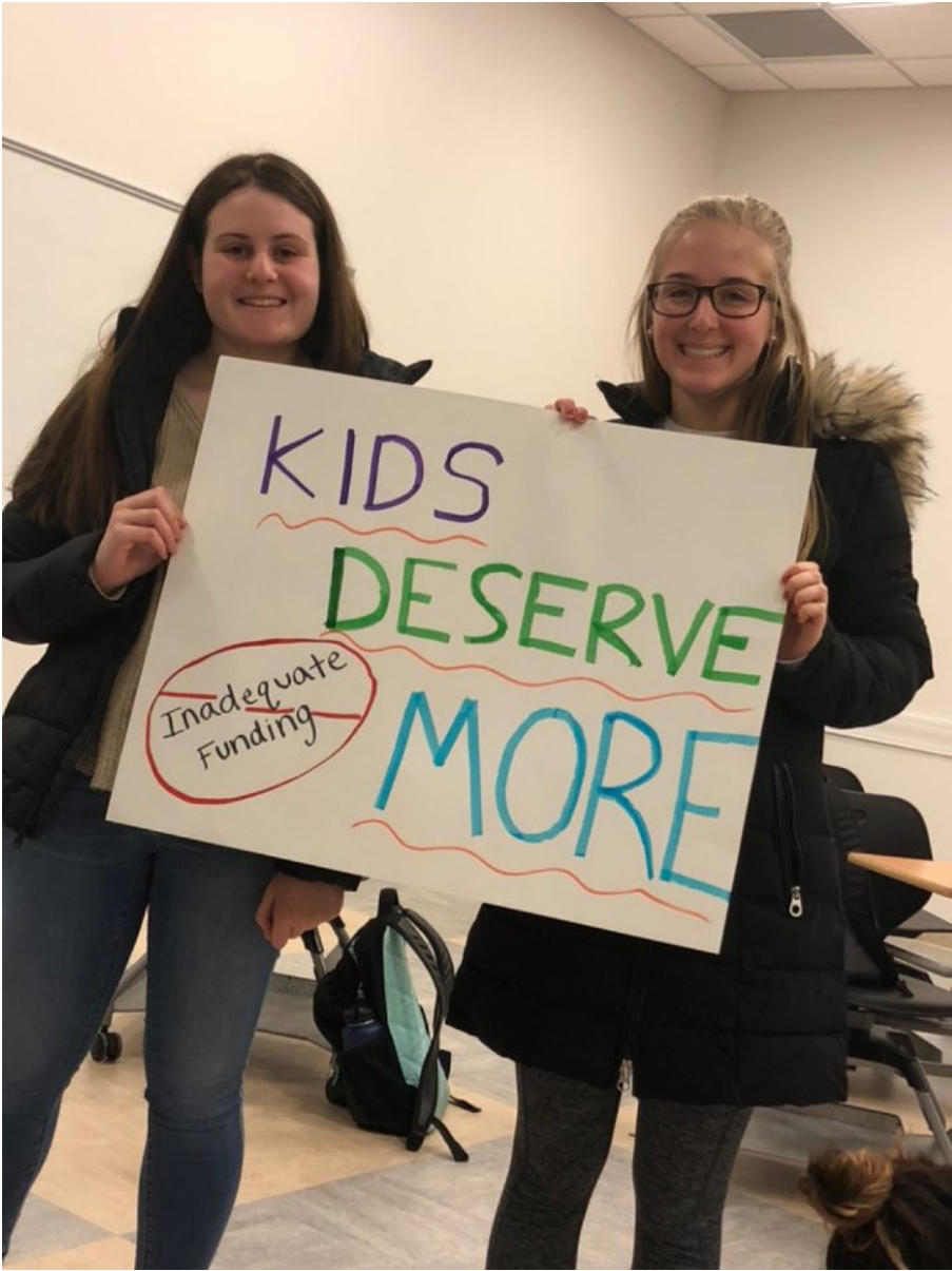
MSEA Aspiring Educator members at University of Maryland College Park make signs for the Rally to Fund Our Schools.