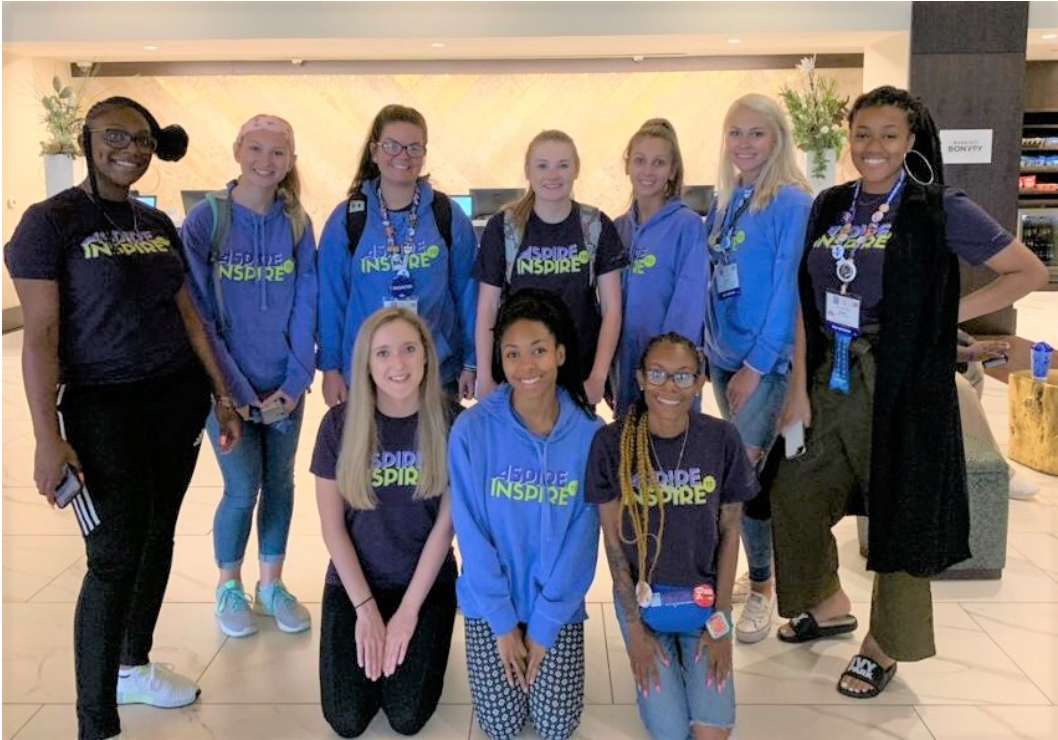
Minority Affairs panel.

10 Aspiring Educators, 5 campuses represented MD at the NEA Aspiring Educator Leadership Summit in Houston.