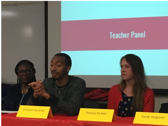
Early Career Educator Teacher Panel at the University of Maryland College Park.

There is a lot to master before completing a certificate program and being ready for the diverse and challenging classrooms that educators will face. MSEA provides trainings, and resources on cutting edge professional development topics.