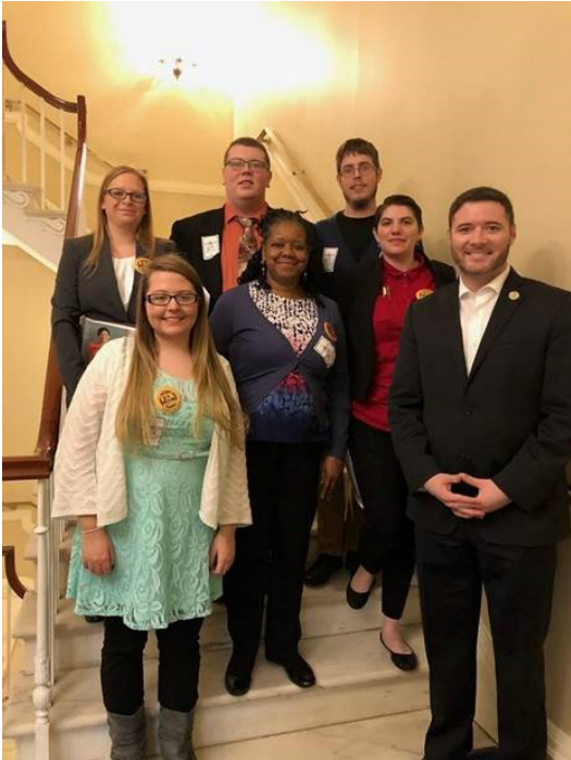
Students from Community College of Baltimore County – Essex attended MSEA’s AE Lobby Night to advocate to Fix the Fund and place casino money in the education budget.

There are a ton of threats facing public education today – from adequately and equitably funding our schools how much teachers get paid, while ensuring that prospective teachers can afford their college education. MSEA and the AE program are tackling those issues now, so educators and their students have the resources they need to thrive.