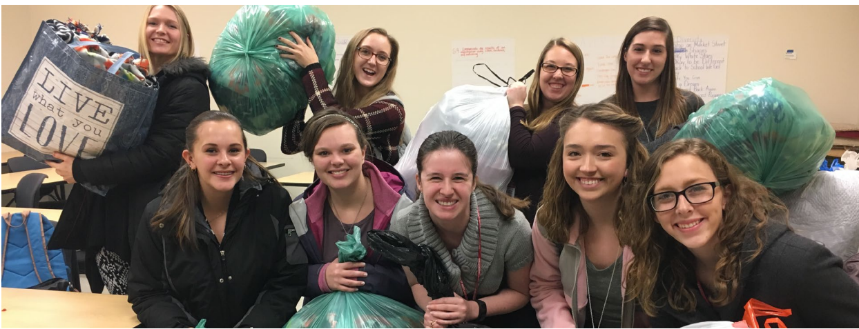
Members of FSEA at Frostburg State – Hagerstown with hundreds of blankets they made for babies in the local hospital.