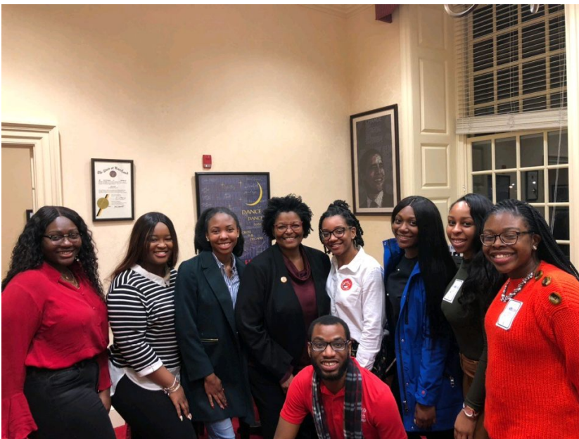
Aspiring Educator members from Coppin and Morgan State met with their senator and lobbied to support (and won!) putting two in service teachers on the state board of ed!