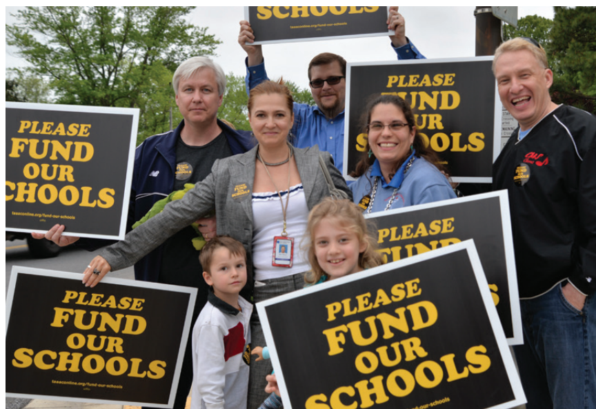
Anne Arundel County mobilizes to fight for funding.

"This is a huge win for us, but the fight is far from over." Between regular meetings with county council members and working with the Public School Labor Relations Board on determining a possible bargaining impasse, TAAAC is building on the member-led momentum and continuing the fight for adequate and equitable education funding in Anne Arundel.