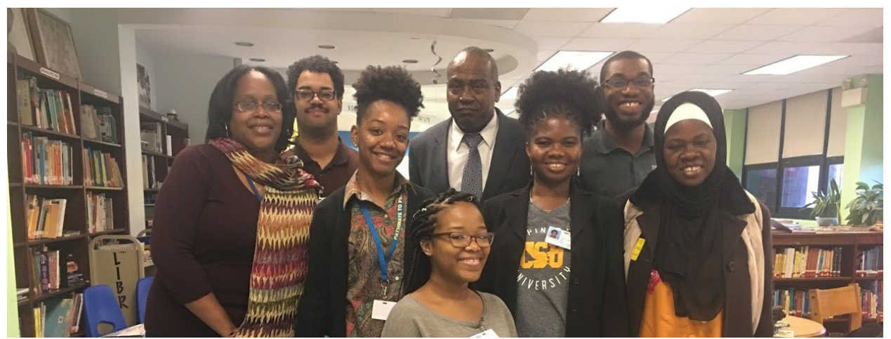
Coppin State MSEA chapter at their local elementary school during Read Across America Week. They read to students and donated books to the classroom.

Educators are a huge part of their community and can make a bigger impact in the classroom when they are a part of the communities that their students are a part of.