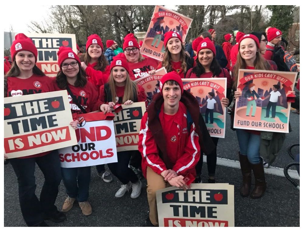
MSEA AE Members at Frostburg Hagerstown joined thousands of educators from across the state to rally to fund our schools!