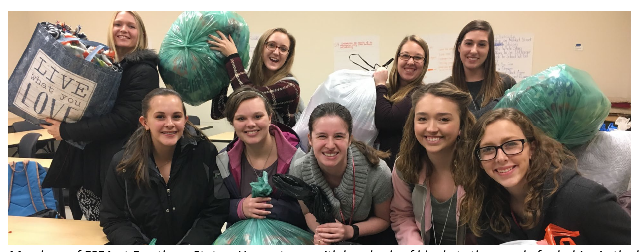
Members of FSEA at Frostburg State – Hagerstown with hundreds of blankets they made for babies in the local hospital.