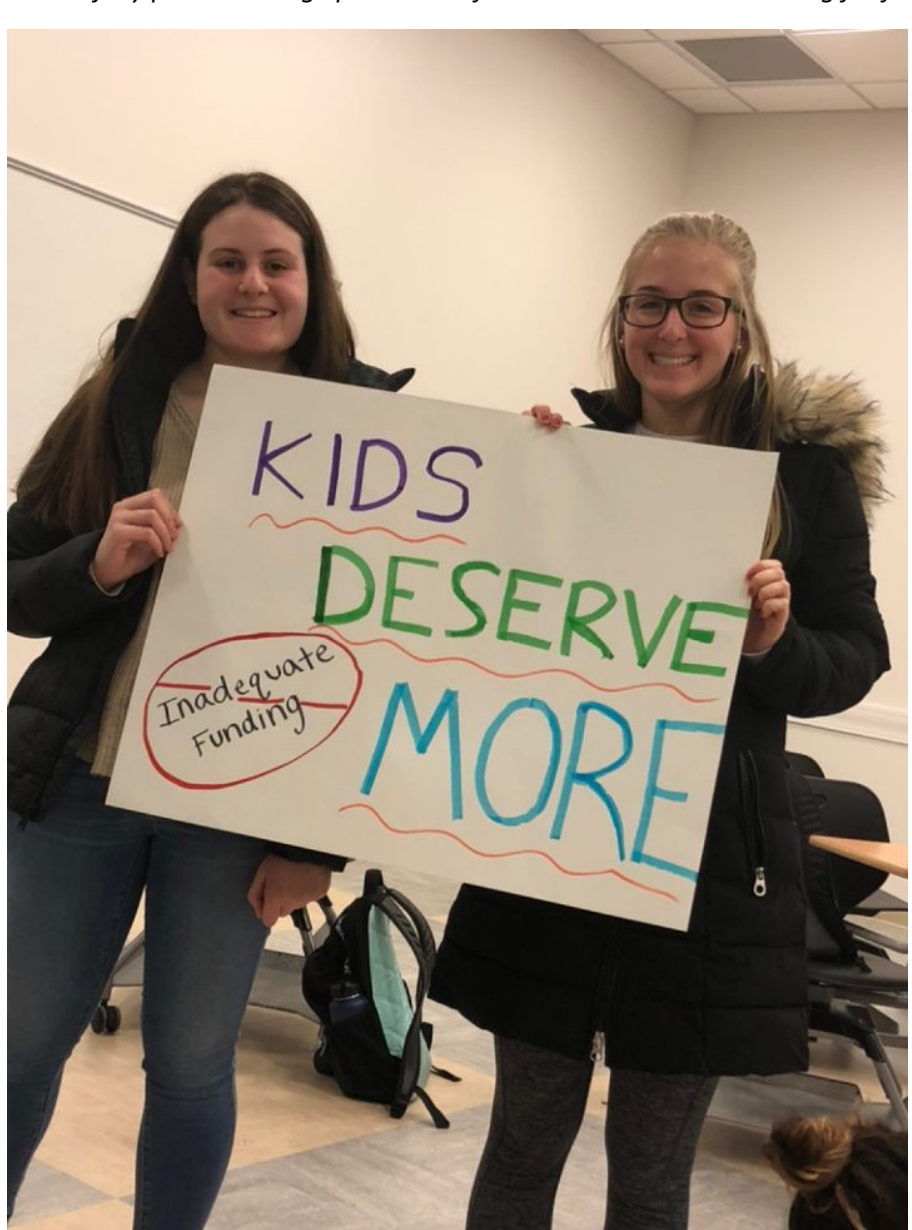
MSEA Aspiring Educator members at University of Maryland College Park make signs for the Rally to Fund Our Schools.