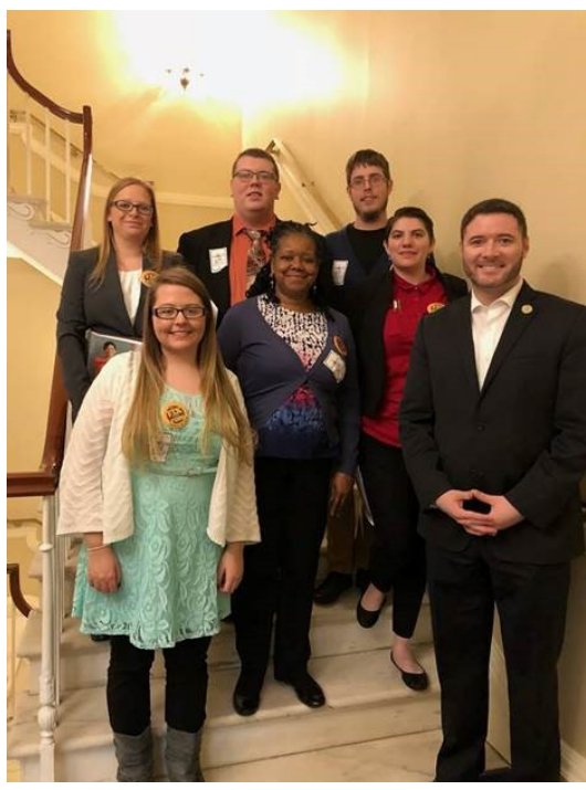
Students from Community College of Baltimore County – Essex attended MSEA's AE Lobby Night to advocate to Fix the Fund and place casino money in the education budget.

There are a ton of threats facing public education today – from adequately and equitably funding our schools how much teachers get paid, while ensuring that prospective teachers can afford their college education. MSEA and the AE program are tackling those issues now, so educators and their students have the resources they need to thrive.