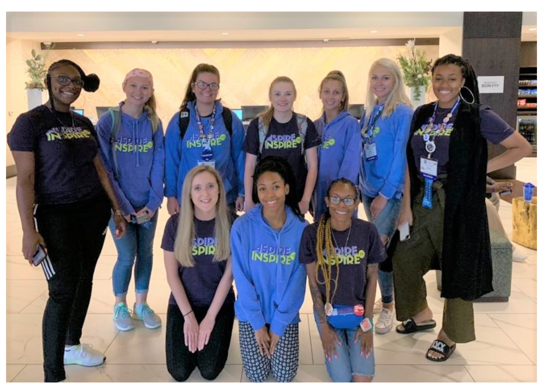
Minority Affairs panel.

10 Aspiring Educators, 5 campuses represented MD at the NEA Aspiring Educator Leadership Summit in Houston.