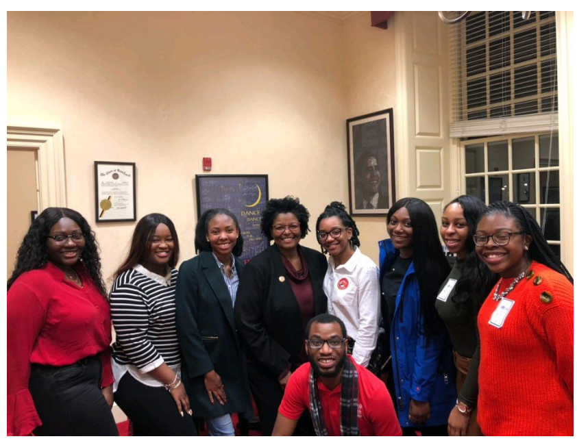
Aspiring Educator members from Coppin and Morgan State met with their senator and lobbyed to support (and won!) putting two in service teachers on the state board of ed!