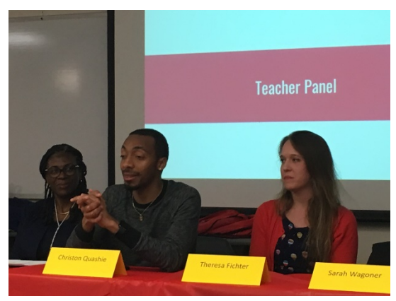
Early Career Educator Teacher Panel at the University of Maryland College Park.

There is a lot to master before completing a certificate program and being ready for the diverse and challenging classrooms that educators will face. MSEA provides trainings, and resources on cutting edge professional development topics.